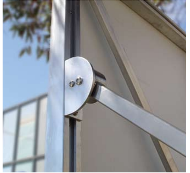
Stainless Steel Brackets