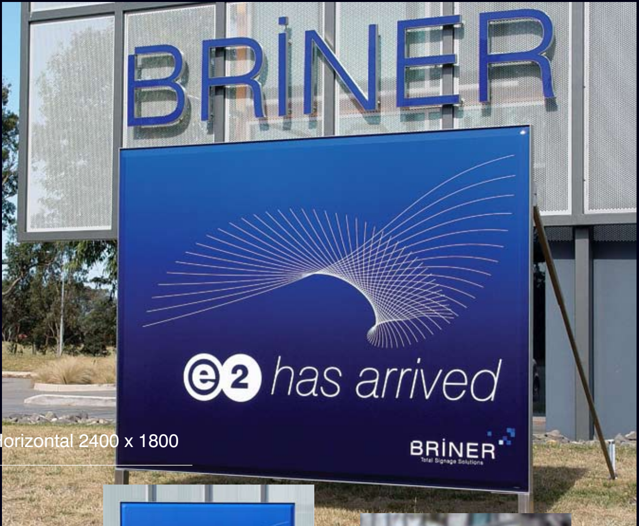
Horizontal 2400 x 1800