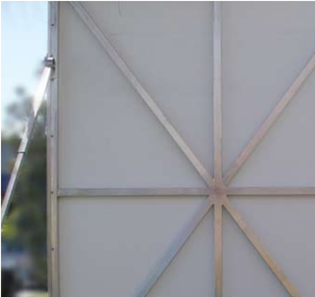
Solid Alloy Construction