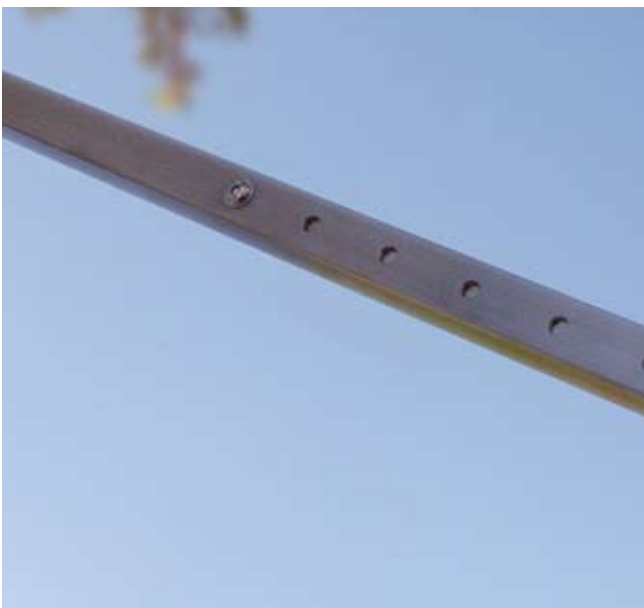
Stainless Steel Extension Arms