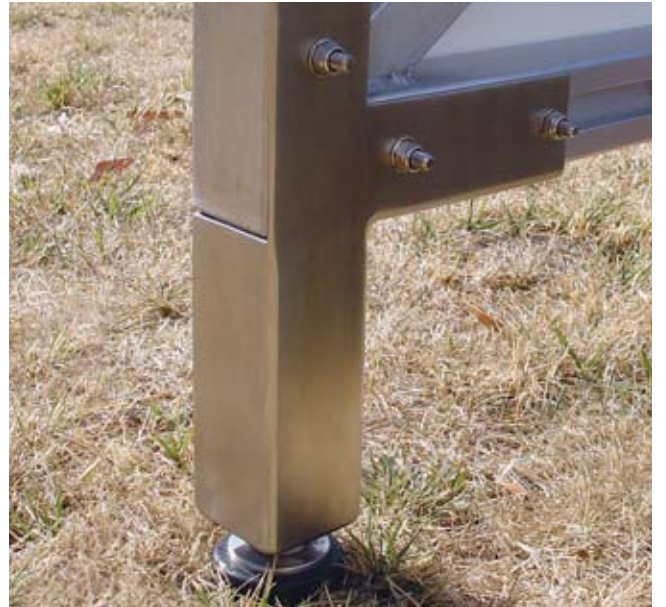
Stainless Steel Legs