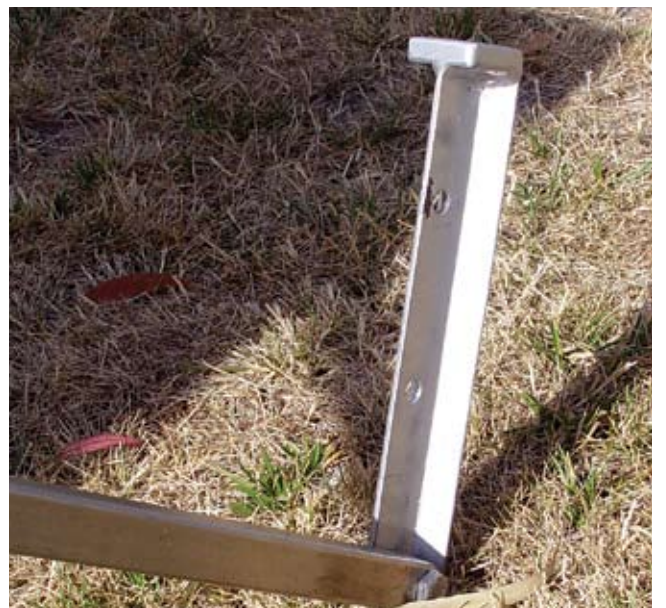
Galvanised Steel Pegs